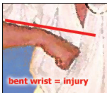
Don't bend your wrist, as if you were on a Harley®! Make a straight line.