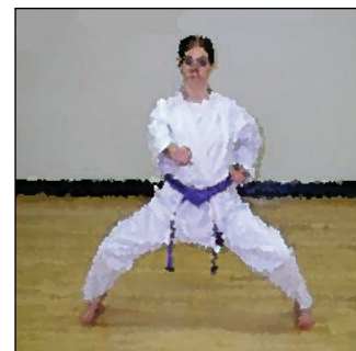
Practicing in a kiba dachi will help you to learn how it feels to square your shoulders and hips

To practice: From kiba dachi (horse stance), start with one hand already out, punching to the center. Relax your shoulders (don't make "earmuffs"). Do not throw your shoulders when punching – keep hips and shoulders square. Pull/push the next punch and focus your energy with a loud KIAA! Punch always to the center. Itosu sensei invented the corkscrew punch : your fist comes out of chamber upside-down, then turns over just before impact (this also keeps your elbows from flaring out). Punch with the two large knuckles, making a straight line from your shoulder, down your arm, to these knuckles. Fists must be tight to avoid injury!